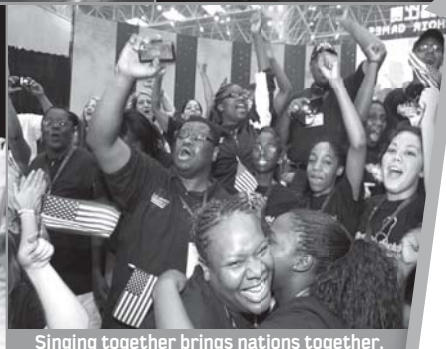
Singing together brings nations together.