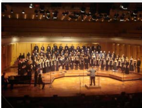
World Youth Choir Anniversary Concert

Die Europäische Union hat das Jahr 2010 zum Jahr für den Kampf gegen Armut und soziale Ausgrenzung deklariert. Mehrere Europa Cantat Aktivitäten wie die Serie von Hearts-in-Harmony Konzerten und das Poverty Requiem passen sehr gut zu diesem Motto. (2011 wird das EU Jahr des Ehrenamts).