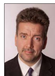
Gábor Móczár President of the European Choral Association - Europa Cantat

Attachments: Schedule of the event (p.3), participation fees (p. 4), Agenda of General Assembly (p. 5)